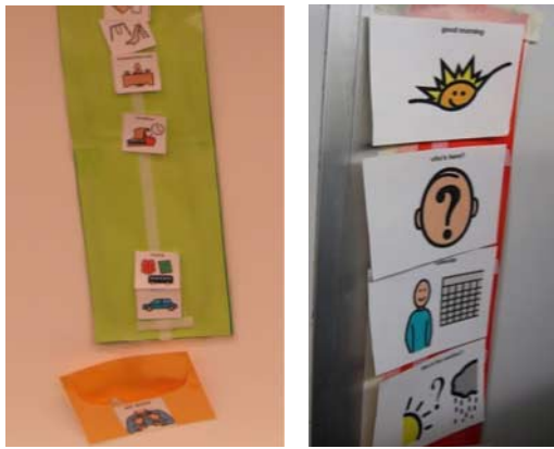
Figure 1: Paper-based visual schedules. (Left) Individual student schedules include representations for each activity of the day attached via Velcro. Students remove each item and place in the envelope to signify a start of an activity. (Right) Large cards representing activities to present to the class.