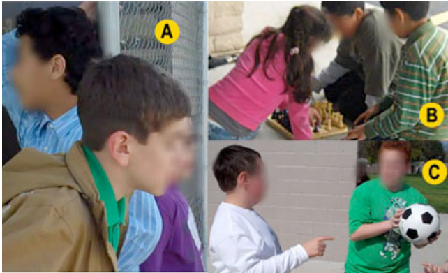
Figure 2. Children during a day of observation. (a) Three children with ASD engaged in passive interactions (b) Children with ASD engaged in a physical interacting (c) Children with ASD engaged in a verbal proactive interaction.

receiving instructions. Specifically, paying attention refers to those actions when the child is observing the execution of an interaction but not participating in it (Figure 2a). If the child is further disengaged and no longer in the student group, we consider him left out. Receiving instructions refers to an interaction in which a caregiver guides a child, but the child is not active in the instruction.